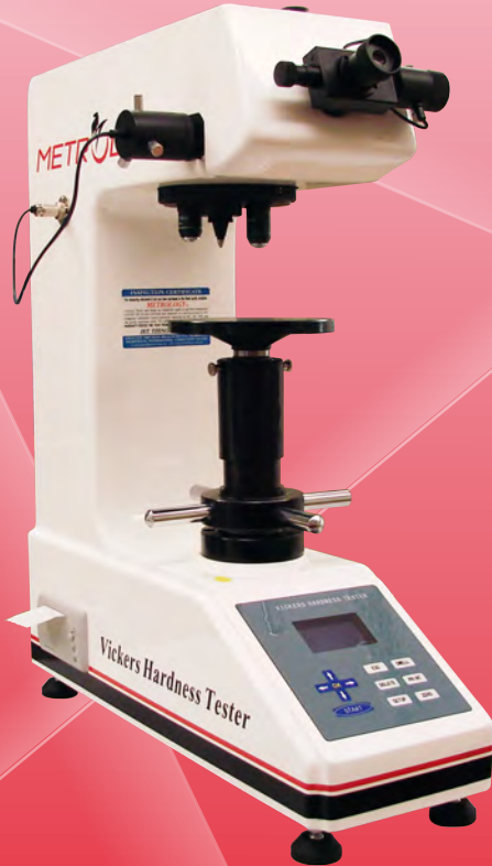
Vickers Hardness Tester (Automatic Turret)