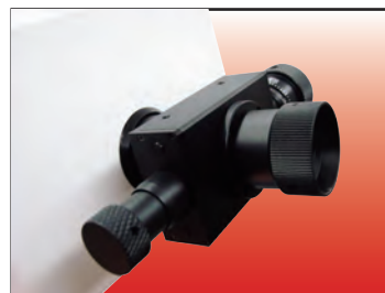
7 Digital eyepiece