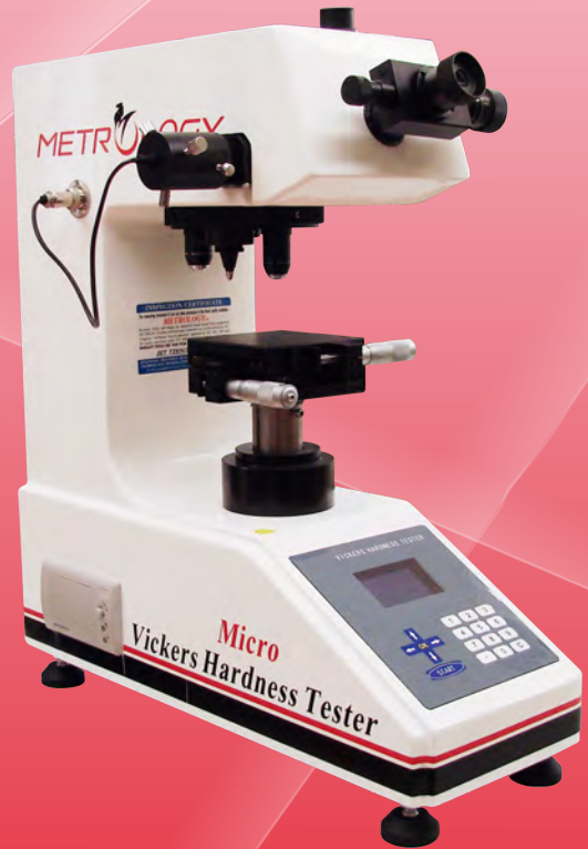
Micro-Vickers Hardness Tester (Automatic Turret)