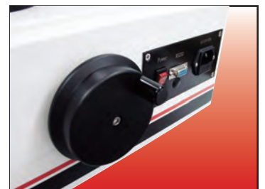
8 Wheel & Output