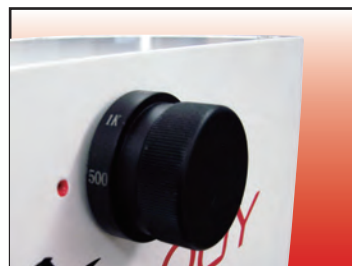
6 Testing force knob