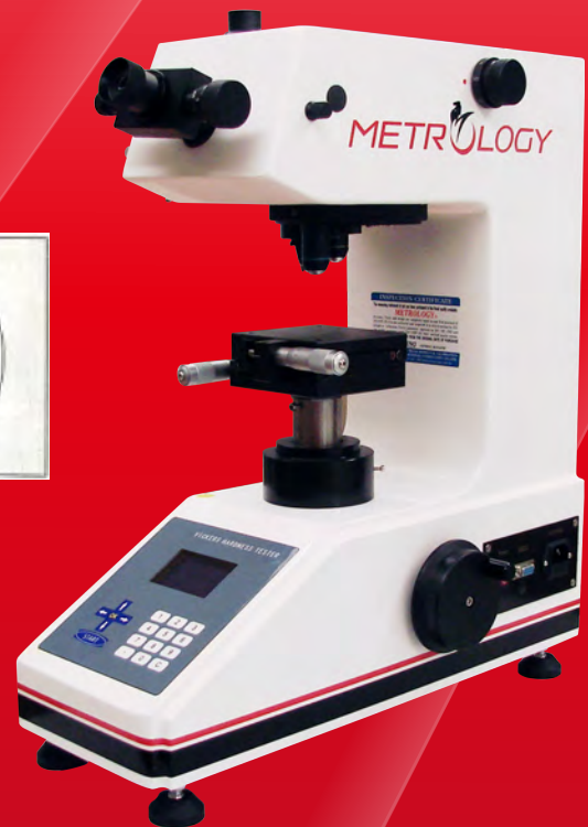
Micro-Vickers Hardness Tester (Automatic Turret)