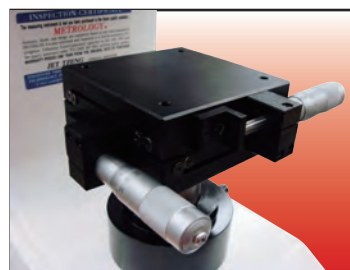
3 XY table