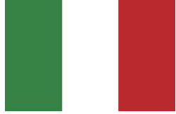
Test Structure Design