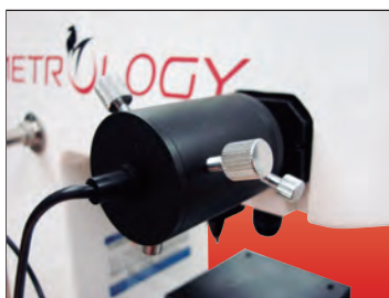
1 Eyepiece illumination