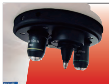
2 Automatic Turret