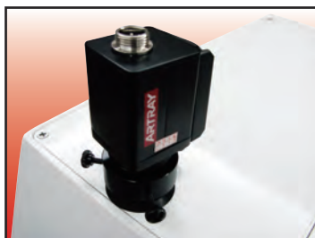
5 CCD output