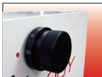
6 Testing force knob