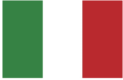
Test Structure Design