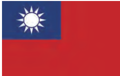
Assembly & Inspection