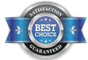
Innovation Design R&D Patented Technology Award