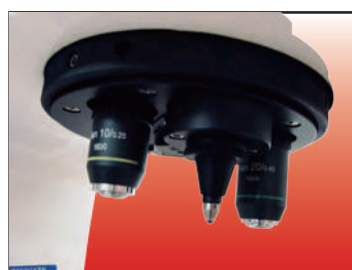
2 Automatic Turret