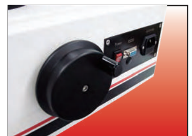
8 Wheel & Output