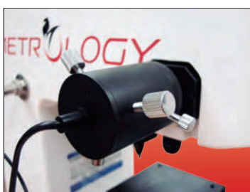
1 Eyepiece illumination