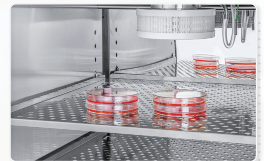
High efficiency filtration system