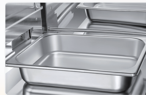
Stainless steel liner & water pond