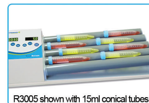
R3005 shown with 15ml conical tubes