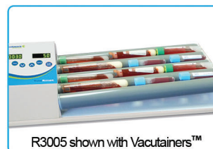
R3005 shown with Vacutainers™