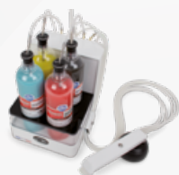
60 MLD00 00