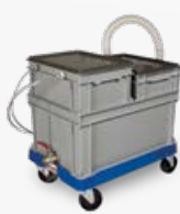
60 A0029 00