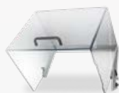
60 MLEP1 00