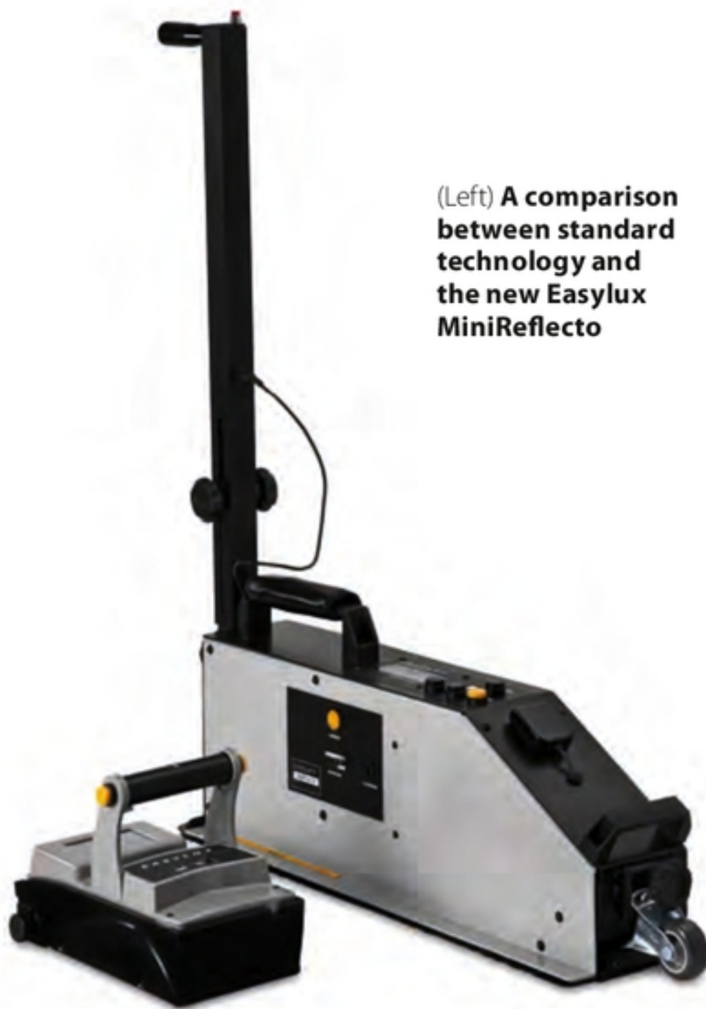
(Left) A comparison between standard technology and the new Easylux MiniReflecto

without the need for special procedures. In the case of reflective studs, the instruments should be able to work with two observation angles simultaneously, to include truck and bus driver geometry.