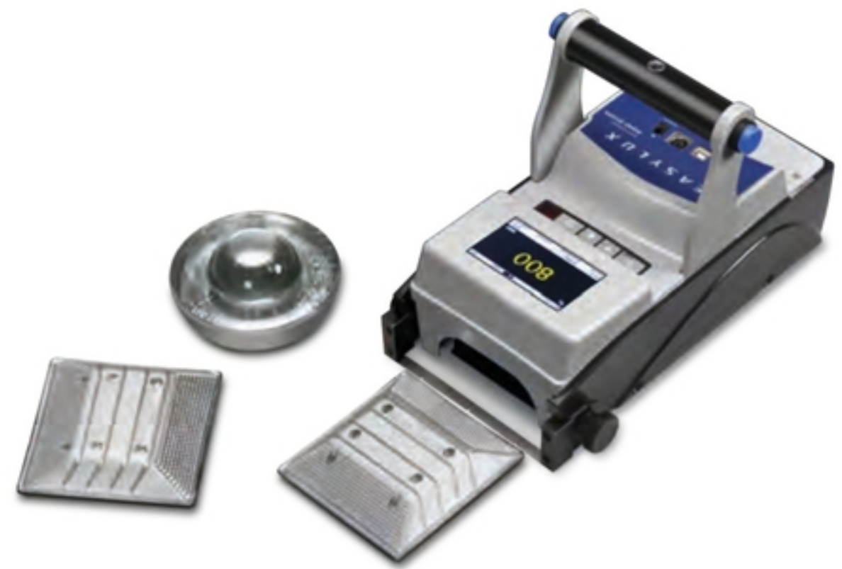
ROAD STUDS RETROREFLECTOMETER Dual angle (0.2° (0.3°) and 1.0° simultaneously)

The richness of the information gathered by dynamic technology enables optimized maintenance programs. However, handheld devices are still widely used in surveillance, quality and performance control, due to their lower cost and operational convenience, especially on short stretches of road. ■