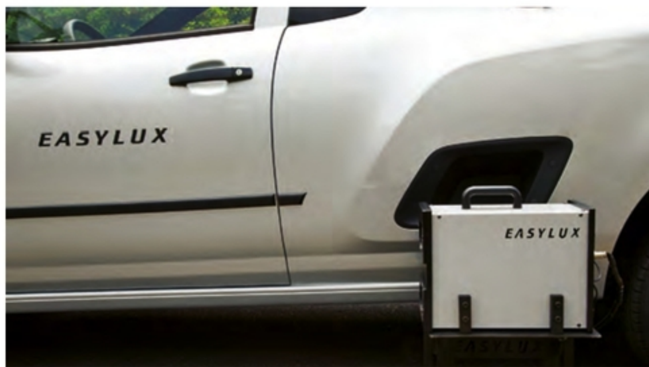
(Above) Easylux's MiniReflecto has been developed in accordance with ASTM E1710, E2176, E2177 and EN1436 (Left) The dynamic retroreflectometer with LED technology from Easylux can provide continuous measurements at speeds up to 120km/h

One of the first horizontal retroreflectometer patents dates back to 1980. It was registered by an Italian citizen named Steffano Pallotta. It was for a system with a light source and a number of photo sensors, engineered