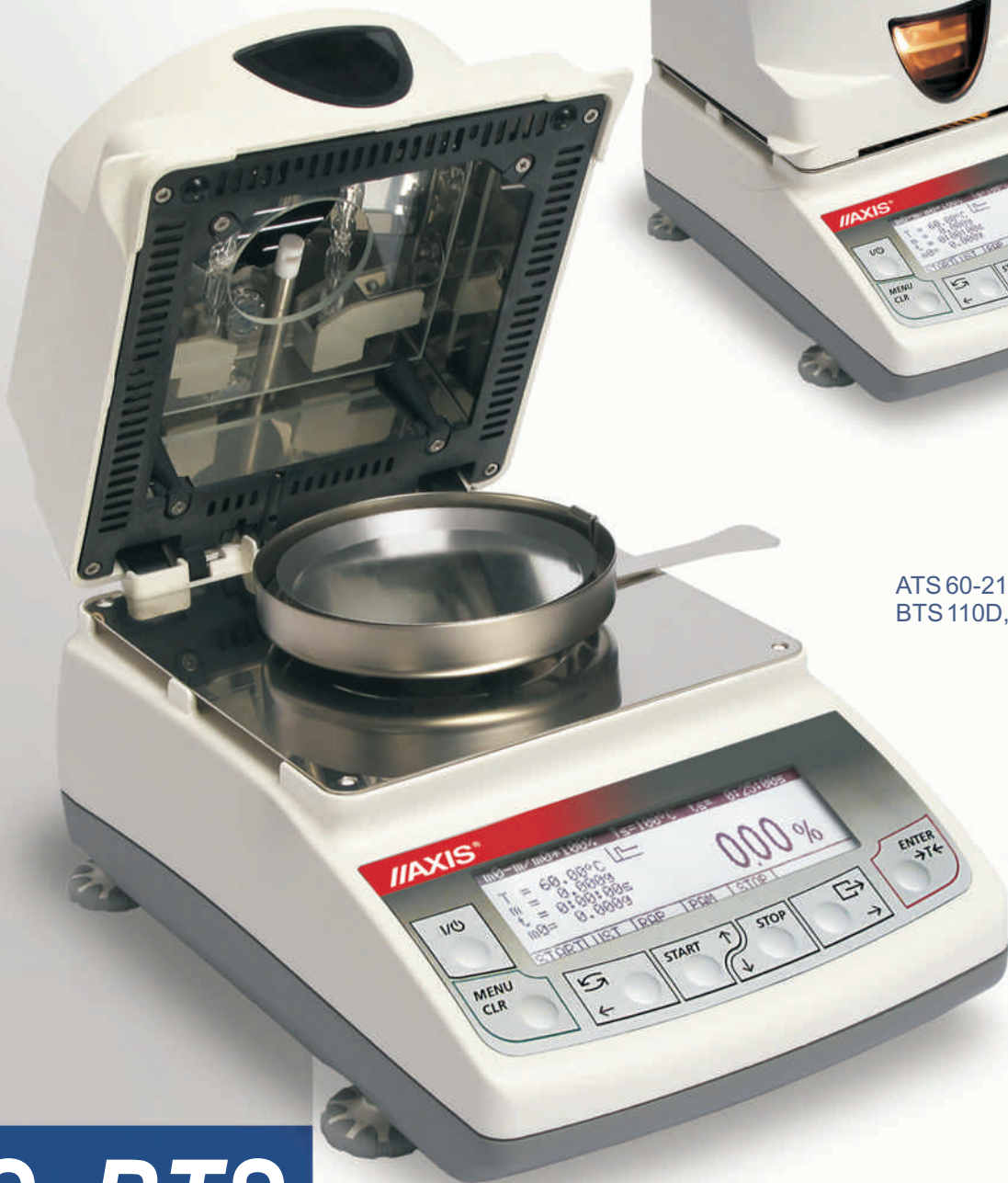
ATS 60-210 BTS 110D, BTS 110